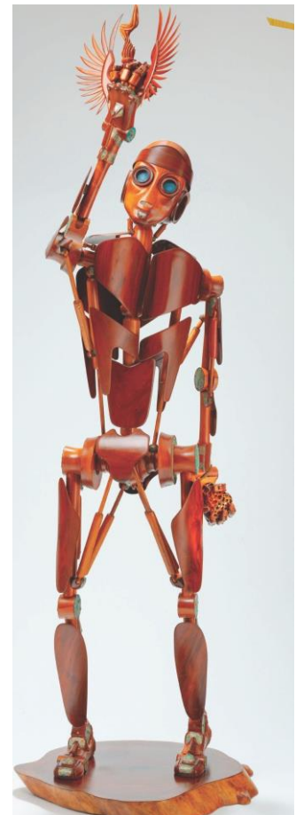
"Drift" by Luke Shaffer Best of Show, Photo: Brad Goda 2022